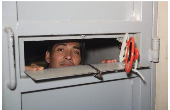
Argentine prison