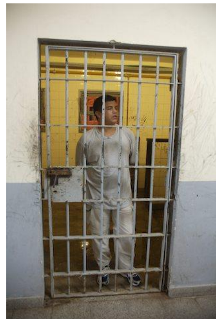
Argentine prison photo by Alan Pogue

All nations should reconsider their military spending and reallocate more money to poverty eradication and social development. We need an immediate allocation from the military spending budget of the amount required to implement the Millennium Development Goals by 2015.